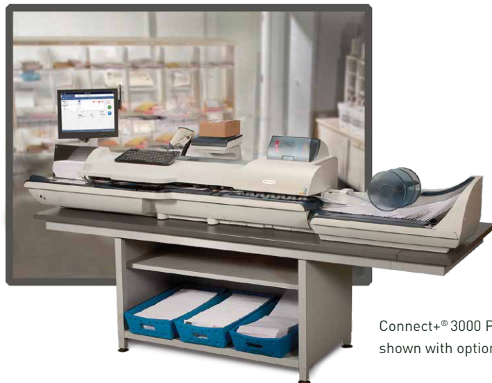
Connect+® 3000 Pro shown with optional console table

Your operation is different than others. You operate in a high-powered environment and can't let anything stand between you and the job at hand. Your internal and external customers are demanding and count on your team to move a lot of mail out the door efficiently and effectively. The equipment you use to get the job done needs to stand up to your tough requirements and provide all the capabilities you need.